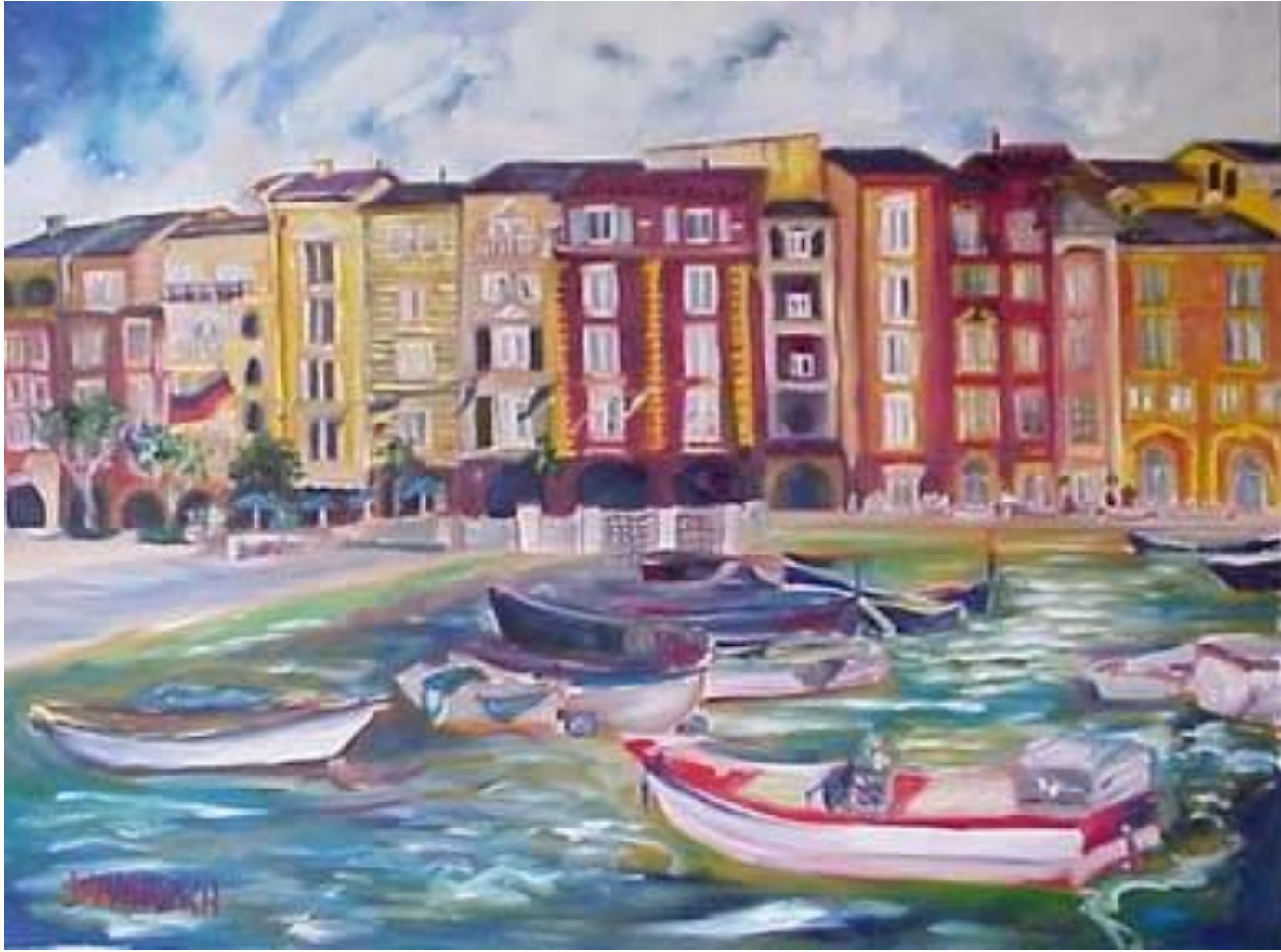
Paris Simile by Dana Roach